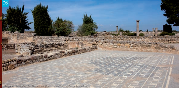
Empuries