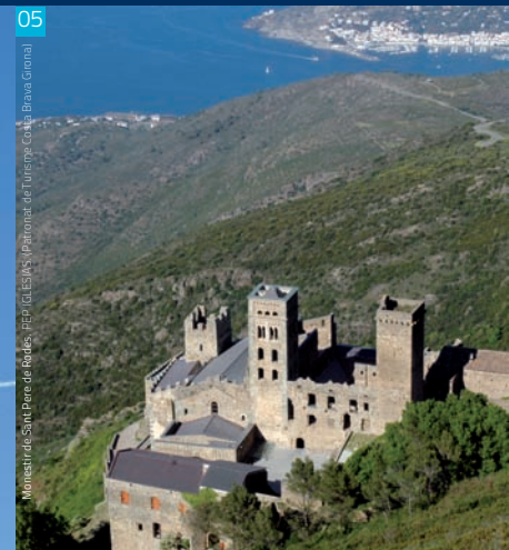
Monestir de Sant Pere de Rodes. JEPi. CULES/W5 (Patronat de l'Inscripció de la Vila de Girona)