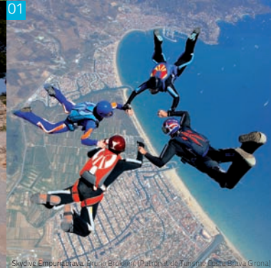
Skydive Empuntadaava, Grup Bricolaxi (Patronat de Turisme Costa Brava Girona)